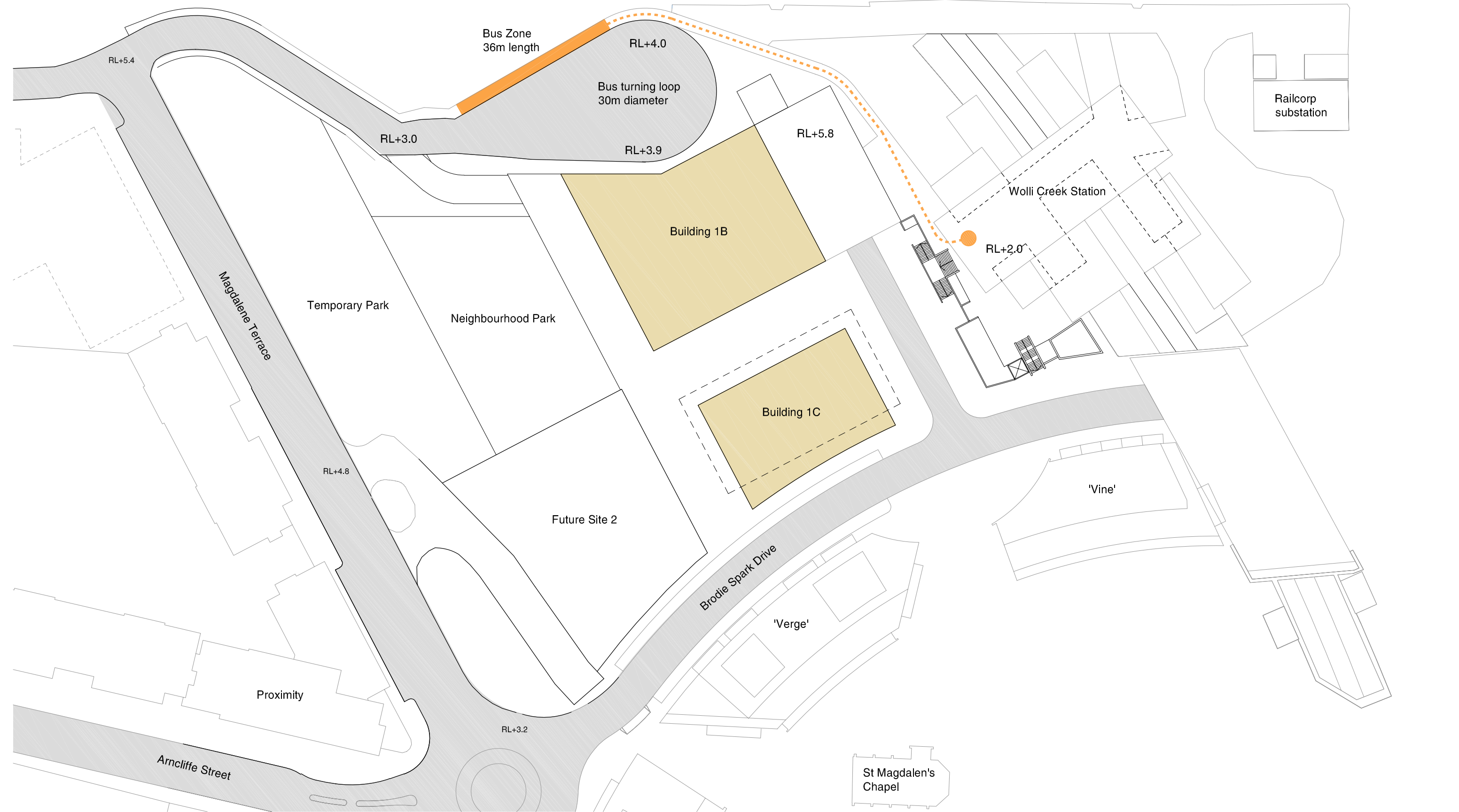
4 DA7-003 Condition after Completion of Stage 5 PLAN 1:750