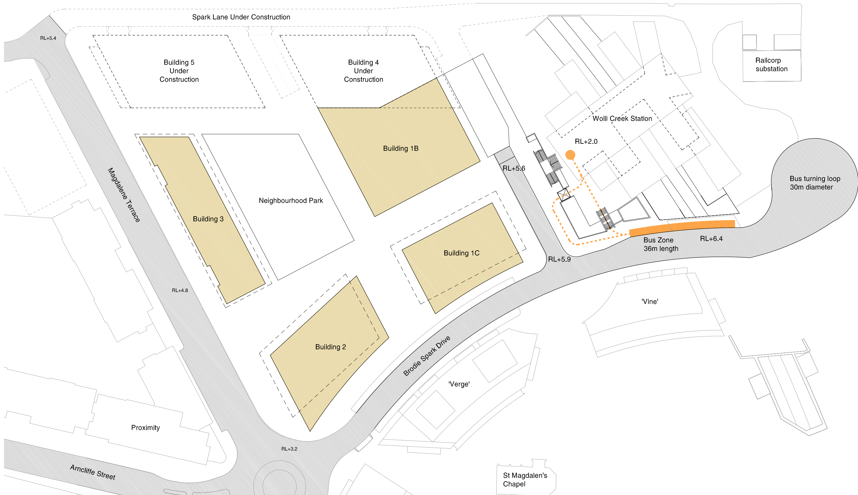
2 DA7-003 Stages 1 to 3 PLAN 1:750